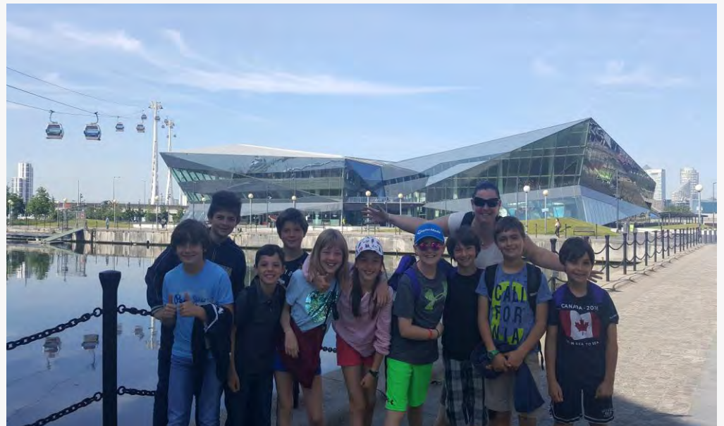
Year 6 children at the Crystal, Royal Victoria Docks