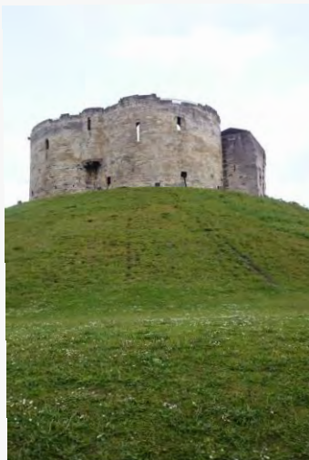
Clifford's Tower, York

If you like trains, a museum is dedicated to you: The National Railway Museum. Right now, two exhibitions are on at the museum, one of which is a mystery set on a train.