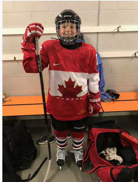
A very happy player